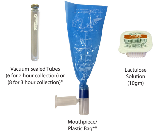
Vacuum-sealed Tubes (6 for 2 hour collection) or (8 for 3 hour collection)*